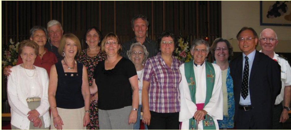
"A Roof for All" coordinating committee